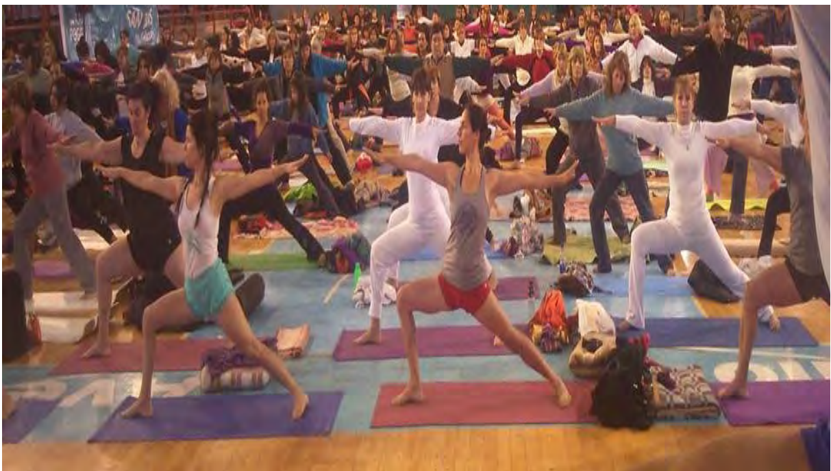
Celebration of the International Day of Yoga in the Province of San Luis (Argentina)