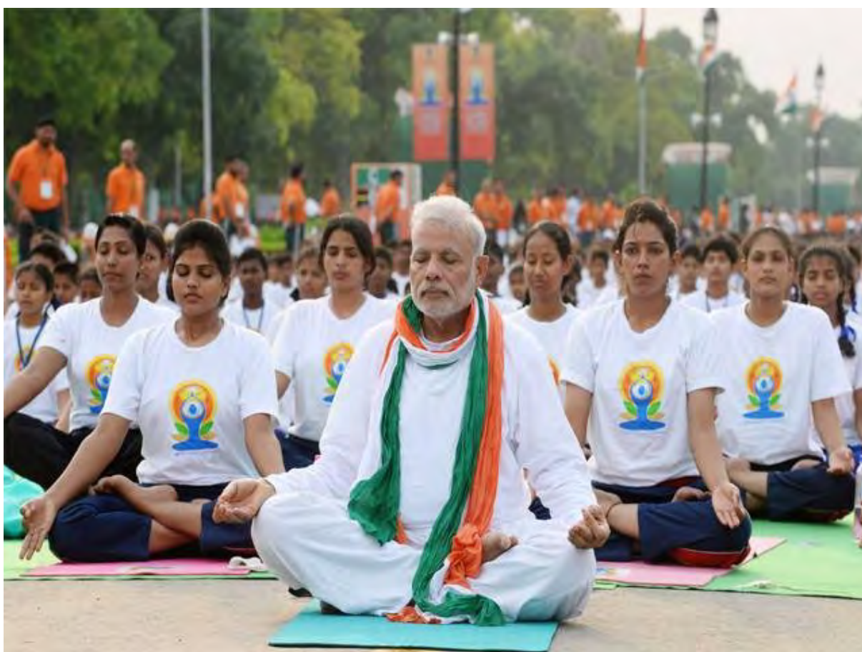
Prime Minister Modi practicing yoga in New Delhi on occasion of the first celebration of the International Day of Yoga.

After Prime Minister's inaugural speech yogic practices followed, amongst the most important were those developed by Indian soldiers in the Sachien Glacier, 18.800 feet above sea level (more than 1.1 million cadets of the National Cadet Corps and many policemen deployed a common yoga protocol, established by the Ministry of Ayurveda, Yoga and Naturopathy, Unani, Siddha and Homeopathy –AYUSH–).