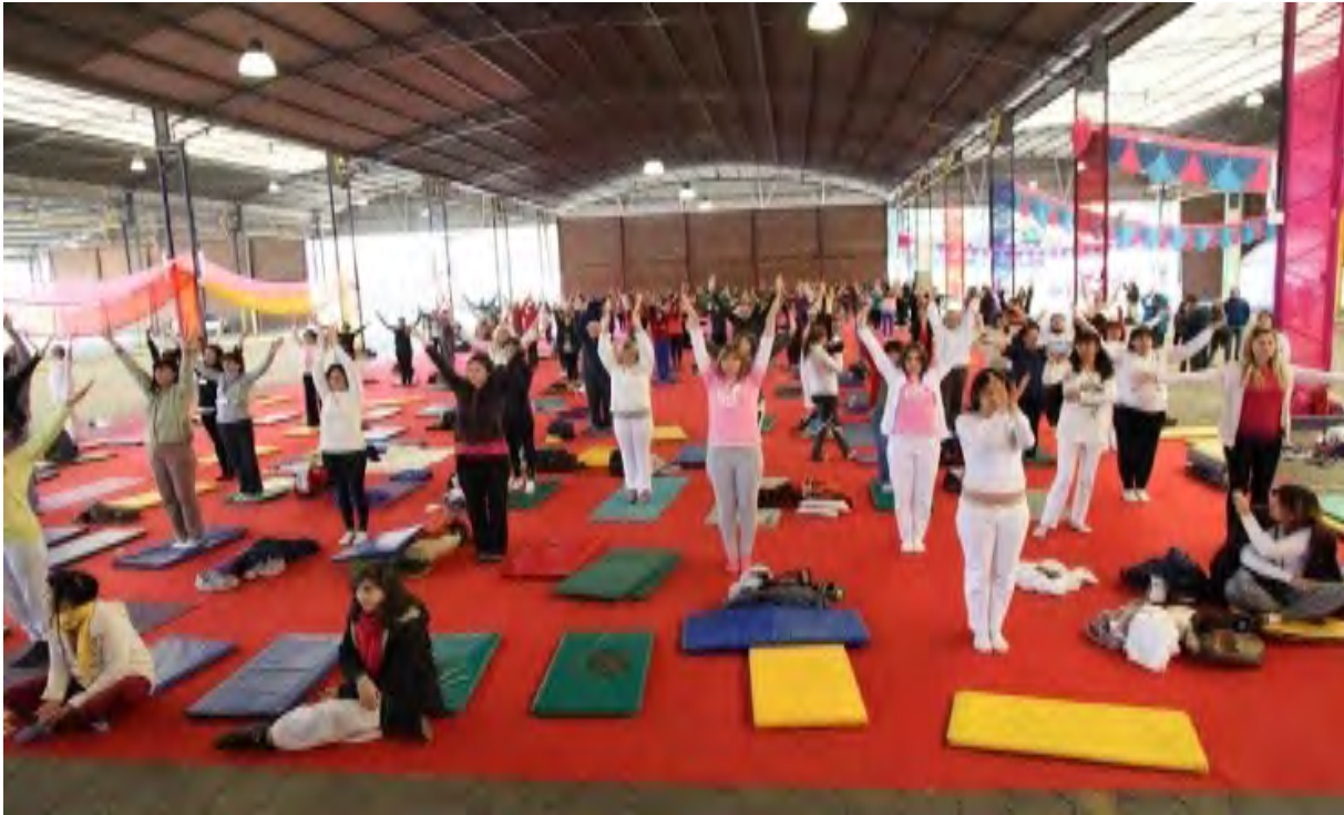
Celebration of the International Yoga Day in the Autonomous City of Buenos Aires (Argentina)

Khatua, accompanied by an official of the Government of the City and the Ambassador of Vietnam, opened the activity, that took place in El Dorrego. There was a numerous attendance and different institutions that carry out, teach and transmit the practice of yoga participated in the ceremony after showing a video with the message of Prime Minister Modi gave for the occasion in Delhi.